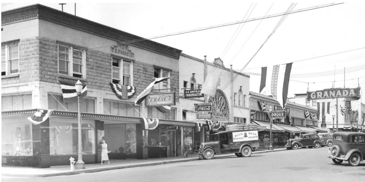
Corner of 4 th and Birch, circa 1930